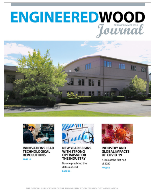
2020 SPRING/SUMMER EDITION

The Journal provides a broad reach to your customers as a complimentary digital magazine posted on the EWTA website at www.engineeredwood.org , featured in various social media streams and distributed via email to subscribers in North America and beyond. Magazine information with links to articles, the member directory and an advertiser index is distributed at the APA Annual Meeting and at other industry conference and events, such as the Timber Processing & Energy Expo, the Panel & Engineered