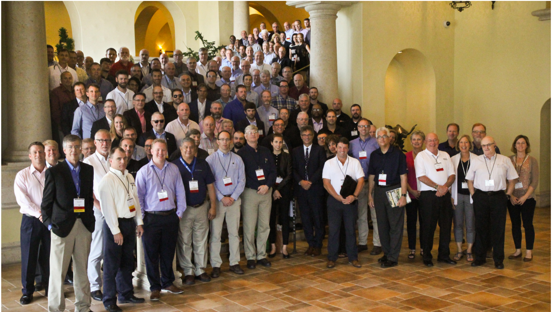
Ewta member company representatives at the 2017 APA Annual Meeting and Ewta Info Fair in Huntington Beach, Calif.

Links to More Information: Ewta Website • APA Website • Engineered Wood Journal