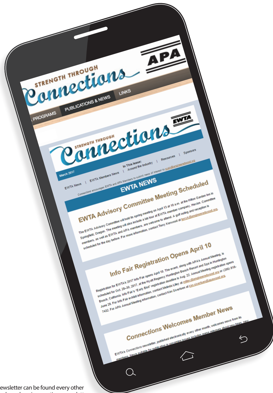
EWTAs Connections newsletter can be found every other month at www.engineeredwood.org/connections-newsletter-

Other EWTAs communications activities include the distribution of APAs's monthly housing starts, quarterly production reports, the APA Structural Panel and Engineered Wood Yearbook, special market reports, as well as the spring membership directory.