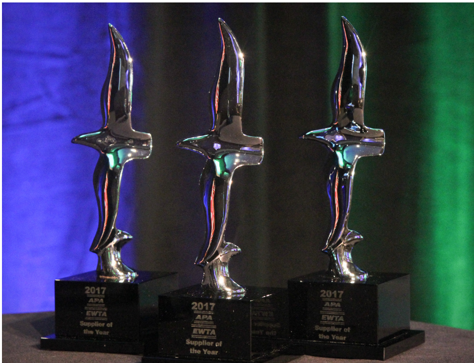
Supplier of the Year award winners take home trophies for their hard work.